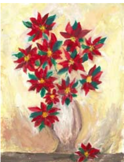
Art Contest Winner

We're getting ready to launch our 2011 writing workshops in conjunction with the North Carolina Writers Network. We have nine spots to fill, so please call BJ if you'd be interested in hosting!